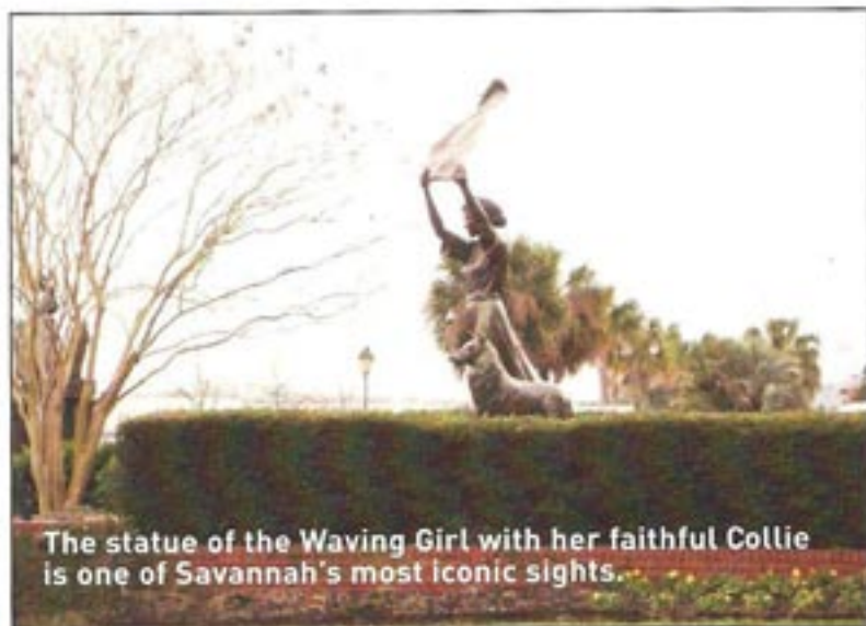
The statue of the Waving Girl with her faithful Collie is one of Savannah’s most iconic sights.

S ultry and sassy Savannah is a vibrant city of picturesque plazas, stately Spanish Moss, mouthwatering cuisine, and locals who love their pooches. Would you expect anything less from the city that is home to the most famous animal in the state – the English Bulldog named Uga who serves as the University of Georgia mascot. Established in 1733, Savannah is known as the “Hostess City” and is also America’s first planned city. An important part of that plan includes the current configuration of 21 public squares and parks throughout the city that are perfect for taking your beloved pooch for a stroll. From dog-friendly happy hours to doggie carnivals, Savannah gives canines the VIP treatment with a generous dash of Southern Hospitality. Savannah is one of the highlights of the low country – an area of the United States comprised of the coastal regions of the Carolinas and Georgia.