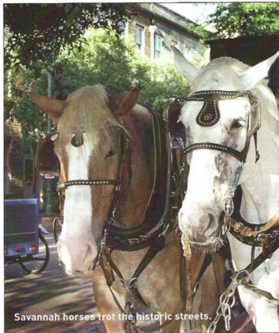
Savannah horses trot the historic streets.

This low-country jewel proves that the Hostess City's hospitality does not extend only to humans. Savannah may be in the low country but in this town pooches live the high life!