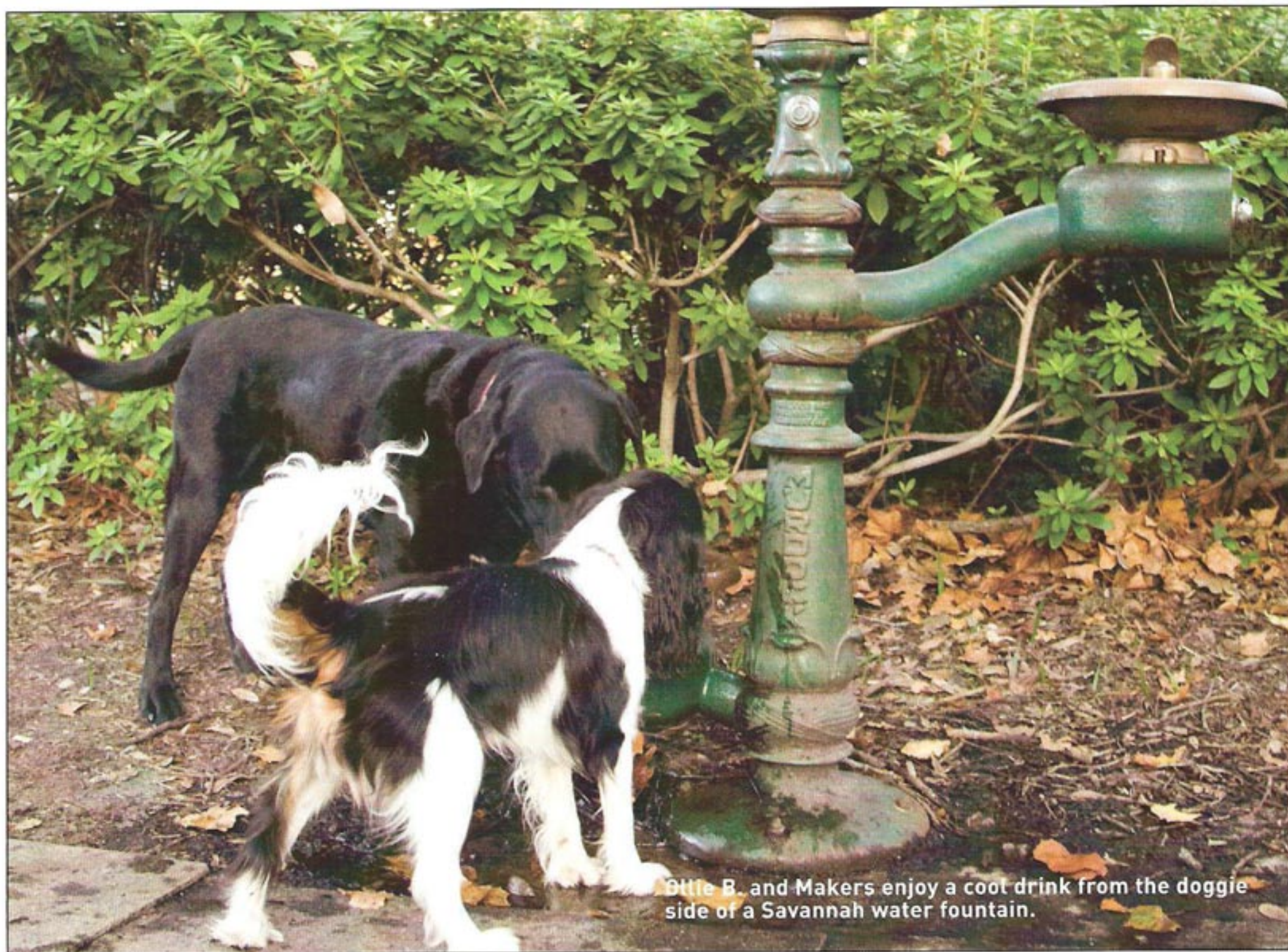
Ollie B. and Makers enjoy a cool drink from the doggie side of a Savannah water fountain.

THE PERFECT ENDING: You deserve a cocktail and your dog deserves a treat after a long day of playing and walking. THE OLDE PINKE HOUSE (912.232.4286) hosts a Yappy Hour twice a month